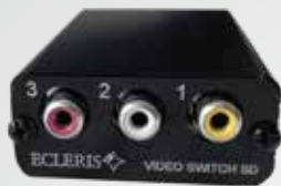
Video switch SD with three video inputs (optional).