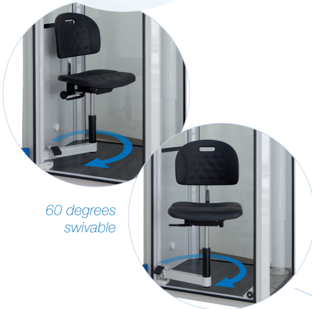
60 degrees swivable

The swivable patient chair and the extremely low door step allow even physically impaired patients easy cabin entry.