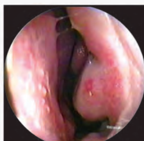
Nasal concha after cryotherapy