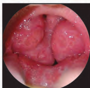
Appearance of the tonsils and throat before cryotherapy