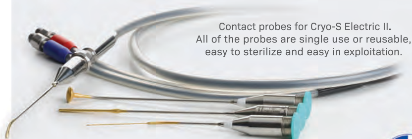
Contact probes for Cryo-S Electric II. All of the probes are single use or reusable, easy to sterilize and easy in exploitation.